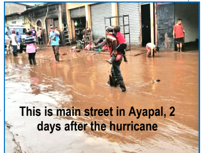
This is main street in Ayapal, 2 days after the hurricane

By using funds from our Support Account rather than our Water Well Account we are still able to fund next year’s wells and water projects. We thank God for you and for all of your support!!